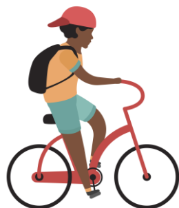
Full time student

1 When civility was measured by the CSEW the measure encompasses: vandalism, graffiti, deliberate damage to property, rubbish, litter, and homes in a poor condition.