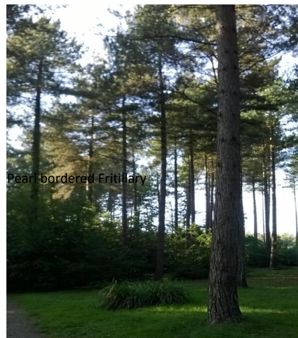
Pearl bordered Fritillary

forest is an important part of the tourism portfolio of the Island, and is well used by islanders and visitors. Vandalism, fires and fly-tipping do occur, but are relatively infrequent given the size and popularity of the forest.