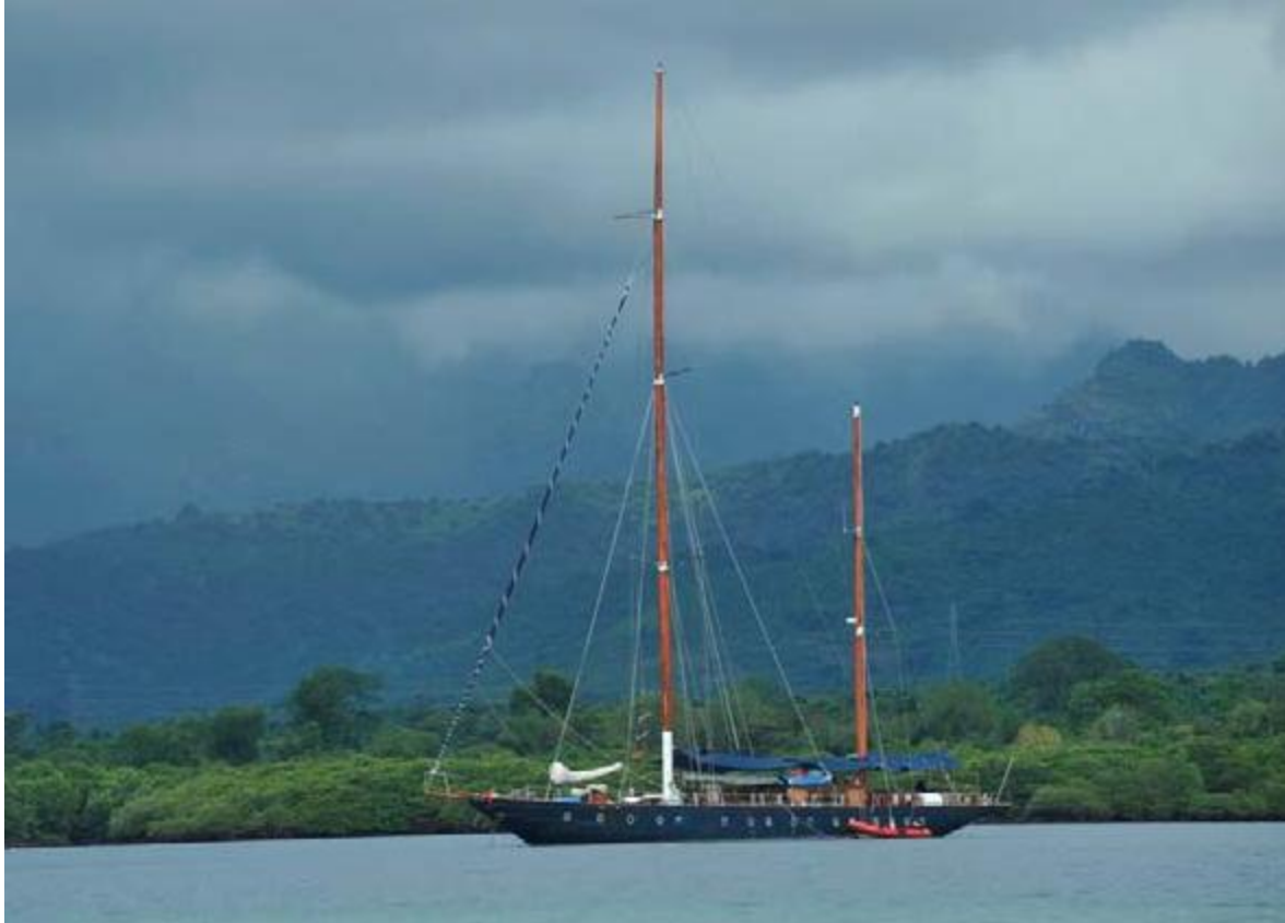
The Mir - the research base