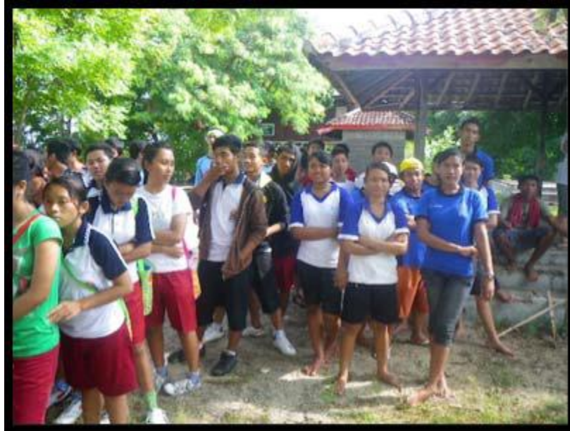
Work with the local community and school children through 'Friends of Menjangan' on an island litter pick.