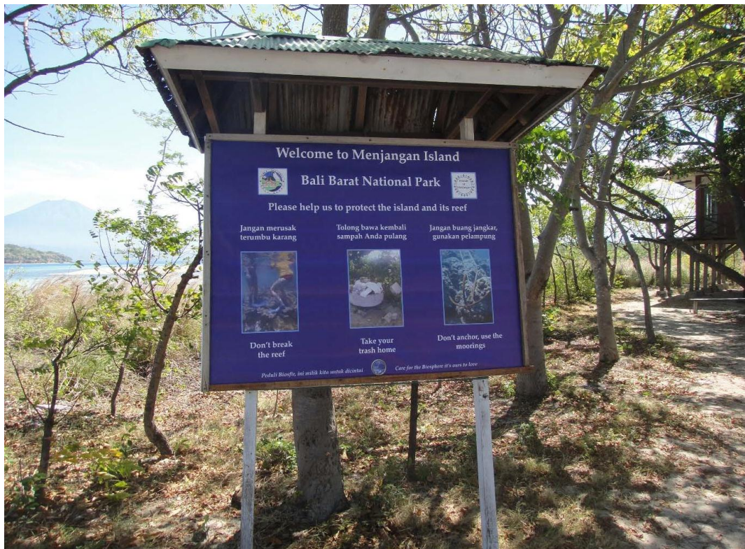
Work with the 'Friends of Menjangan' to protect the area.