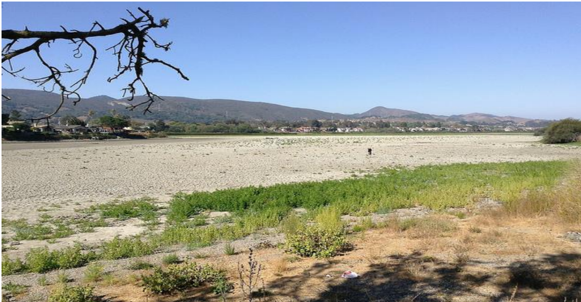
California Drought, Laguna Lake © Docent Joyce, Flickr.

Watch this video to provide the context for the activity. Go to BBC website http://www.bbc.co.uk/news/magazine-19121807