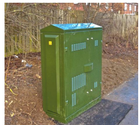
Photograph 2 Data is transmitted at super-fast speeds to street cabinets before moving more slowly into homes along copper wires

■ Local champions Canvassing for broadband at a grassroots level has brought great success in some remoter / low population density regions. In 2003, BT upgraded internet services in some rural areas after "grass-roots" demand was demonstrated (Todmorden was the first, after 200 locals registered interest).