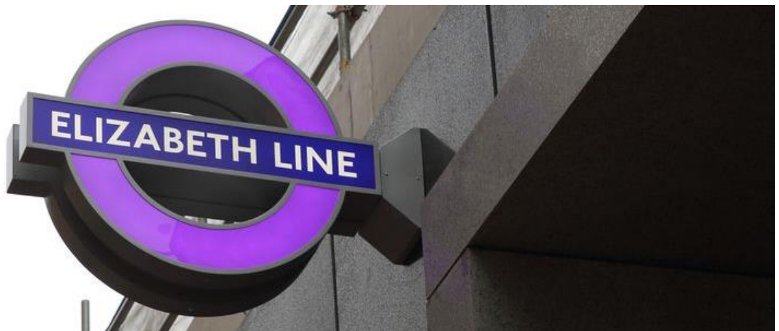
Figure 1 the Elizabeth line © Sign Design Society

The new train line will increase London rail capacity by 10% with each train capable of taking 1500 passengers far greater than on the present TfL system. An extra 1.5 million people will be within 45 minutes of central London once the line is fully opened in 2023.