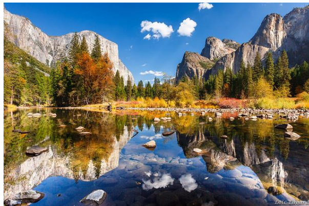
Yosemite National Park

Yosemite National Park , California. Includes North America's largest waterfall (Yosemite Falls) and the world's tallest uninterrupted granite monolith (El Capitan).