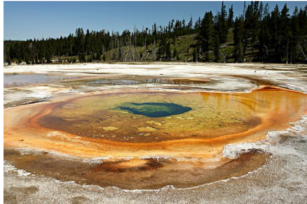
Yellowstone National Park

Yellowstone National Park, Wyoming. More than 10,000 hot springs, fumaroles, and geysers – Old Faithful is the most famous landmark. In 1872 Yellowstone became the first national park. Yellowstone Lake is North America's highest altitude lake.