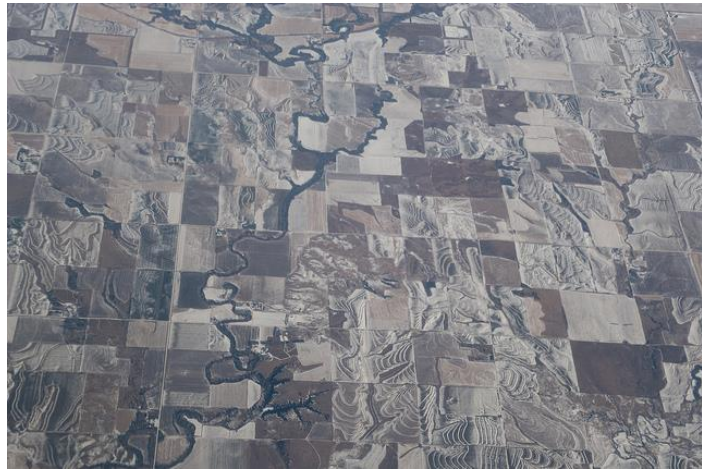
Great Plains

Great Plains: Grassland region of North America between the Rocky mountains and the Mississippi river.