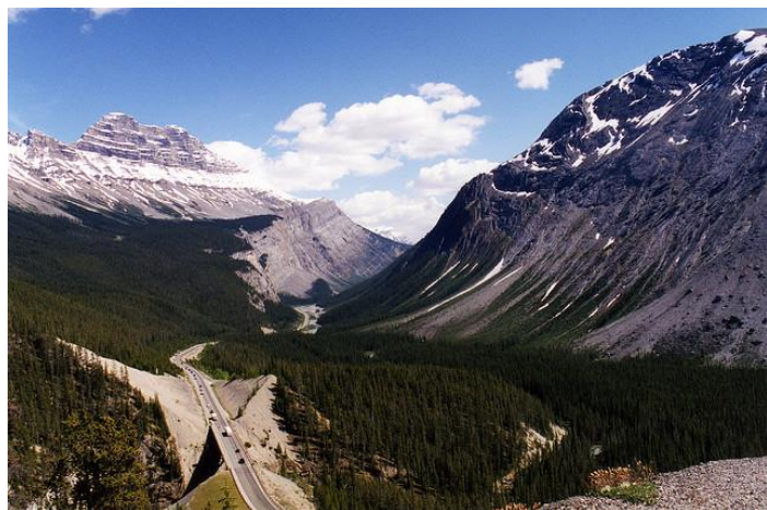
Rocky Mountains

Rocky Mountains: A major mountain range located in the West. The range stretches from Canada nearly to Mexico. Its highest peaks are in Colorado, the tallest is Mount Elbert (4,400m).