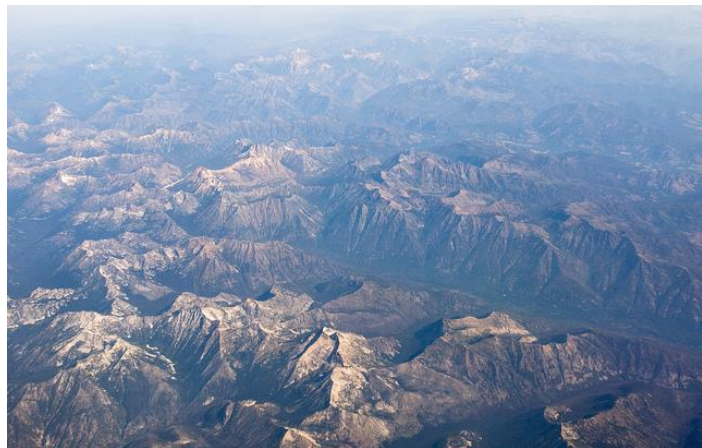
Cascade Mountains

Cascade mountains: Located in the North West this includes large intermittent volcanic mountains.