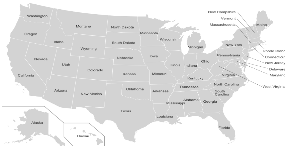
Map of USA

The United States of America is a federal republic made up of 50 states.