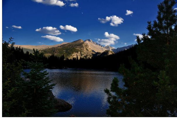
Rocky Mountain National Park

Rocky Mountain National Park, north west America: Shaped by glaciers and remained covered in ice until about 11,000 years ago.