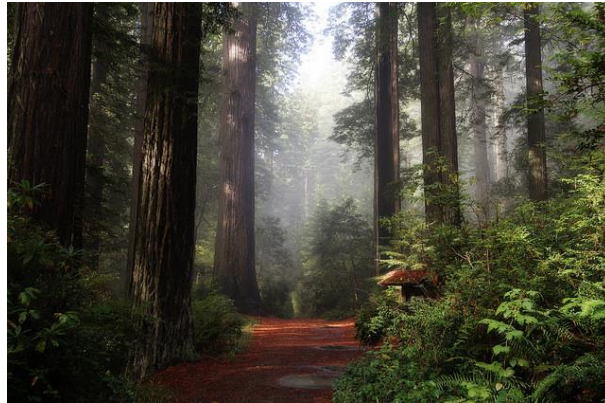
Redwood National Park

Redwood National Park, California: Named for its famous sequoias.