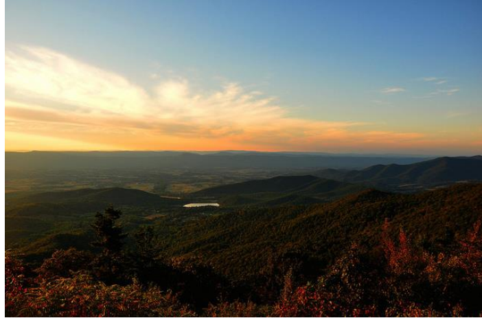
Appalachian Mountains

Appalachian Mountains: Located in the North East. They are a line of low mountains separating the eastern seaboard from the Great Lakes and the Mississippi basin.