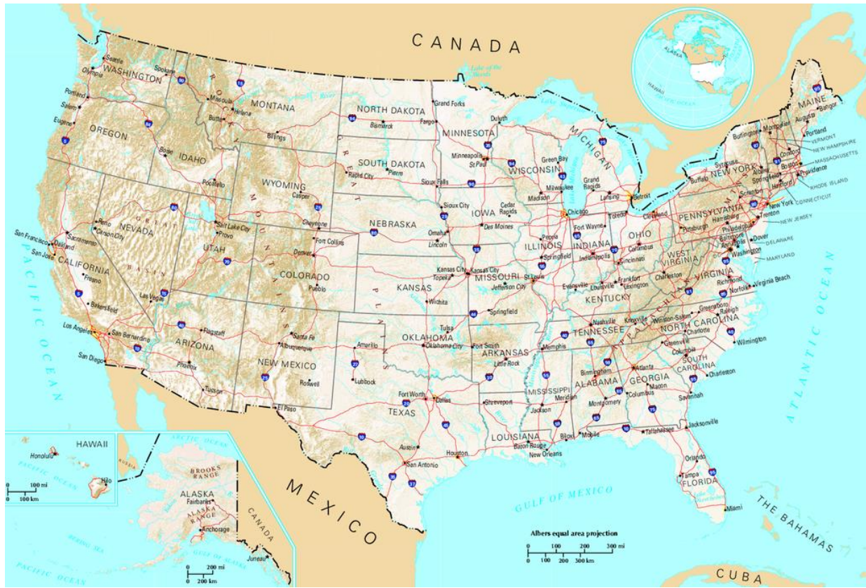
Map of USA

The population distribution across the USA will be explored in more detail later in this module. However the exercises in this lesson introduce pupils to some of the key settlements in the USA.