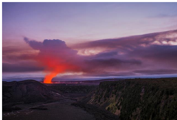
Hawaii

Hawaii volcanoes, Hawaii: One of the world's most volcanically active spots located on the Hawaiian Island in the Pacific Ocean. Two active volcanoes Kilauea and Mauna Loa.