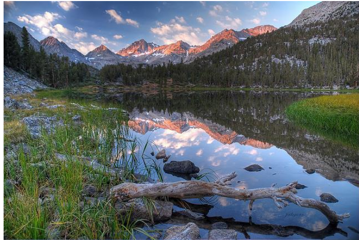
Sierra Nevada

Sierra Nevada: Mountain range in the west running 64km north to south and approximately 110km across. It includes Lake Tahoe which is the largest alpine lake in North America.