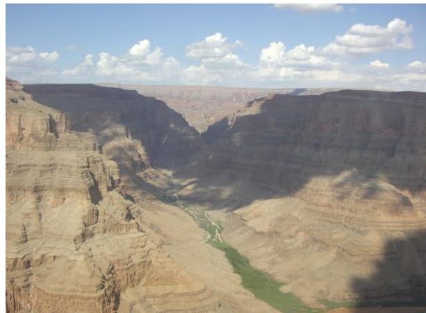
Grand Canyon

Grand Canyon, Arizona: After the Great Smoky Mountains, Grand Canyon is the second most visited national park, at least 5 million people visit every year. Stretches 277 miles along Colorado River. In places up to a mile deep and 18 miles wide.